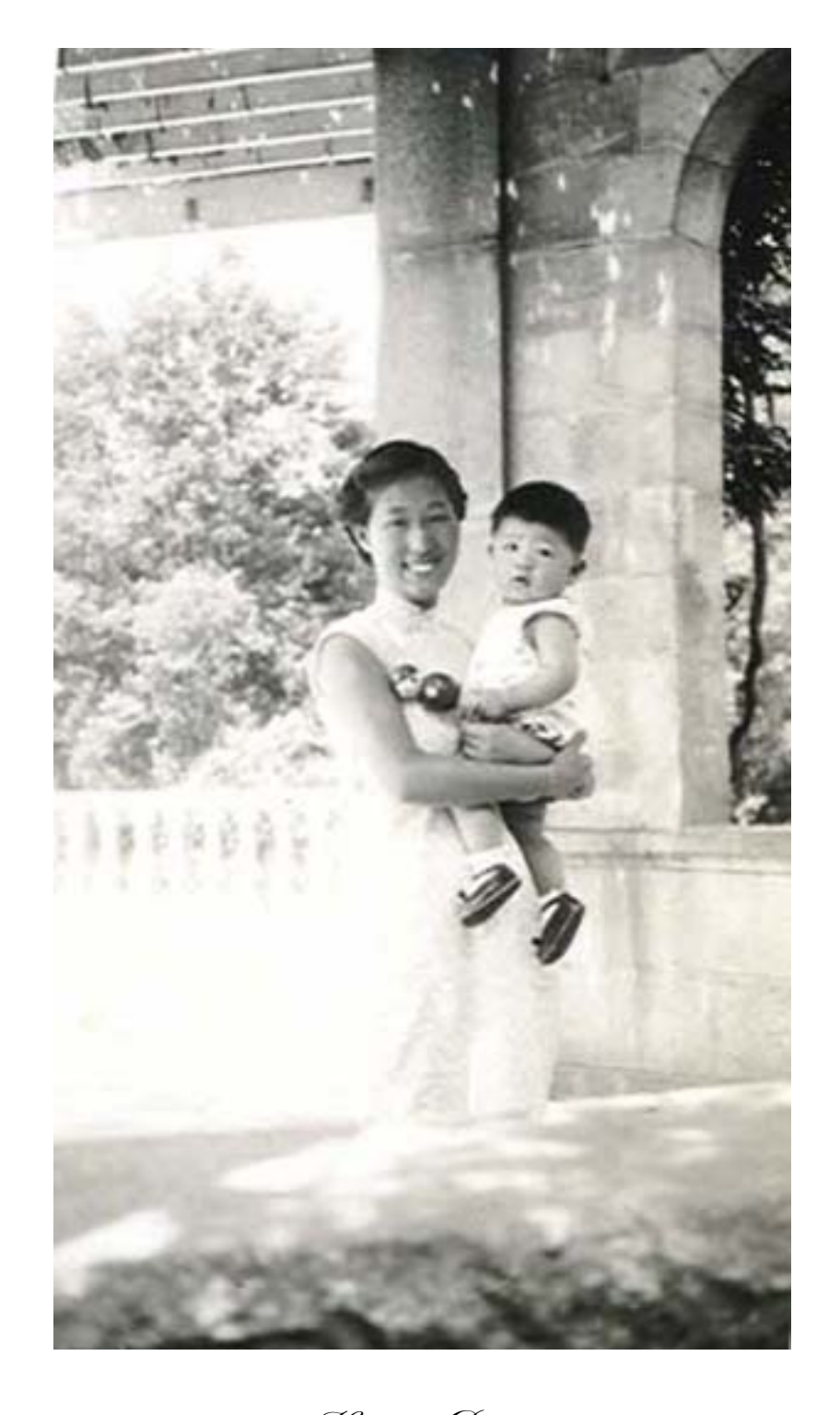
Happy Days Attending Shanghai Conservatory of Music