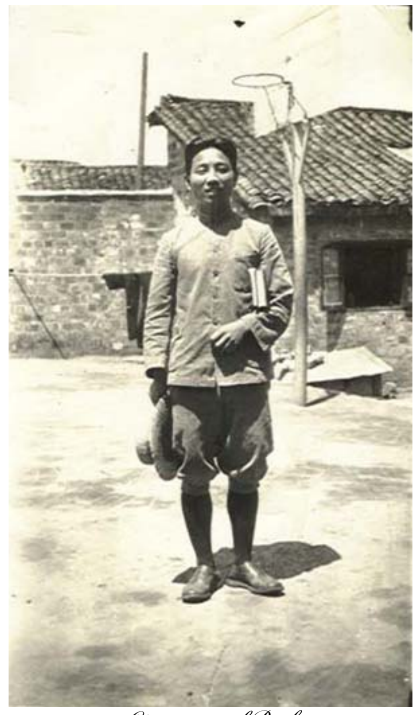
Given name of Paul