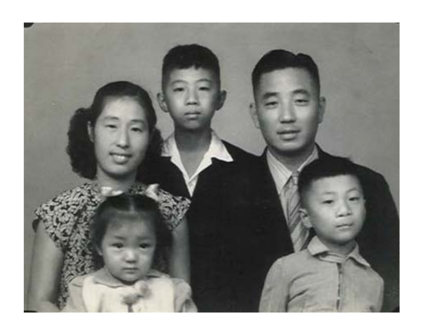
Mailed to America