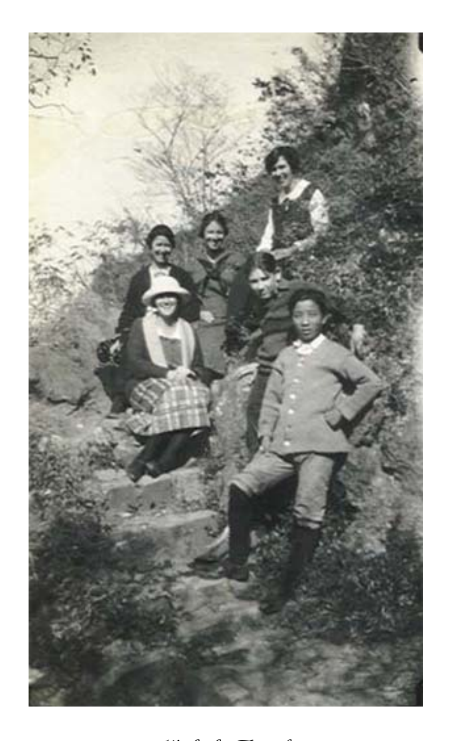
With the Family Picnic near Nanking