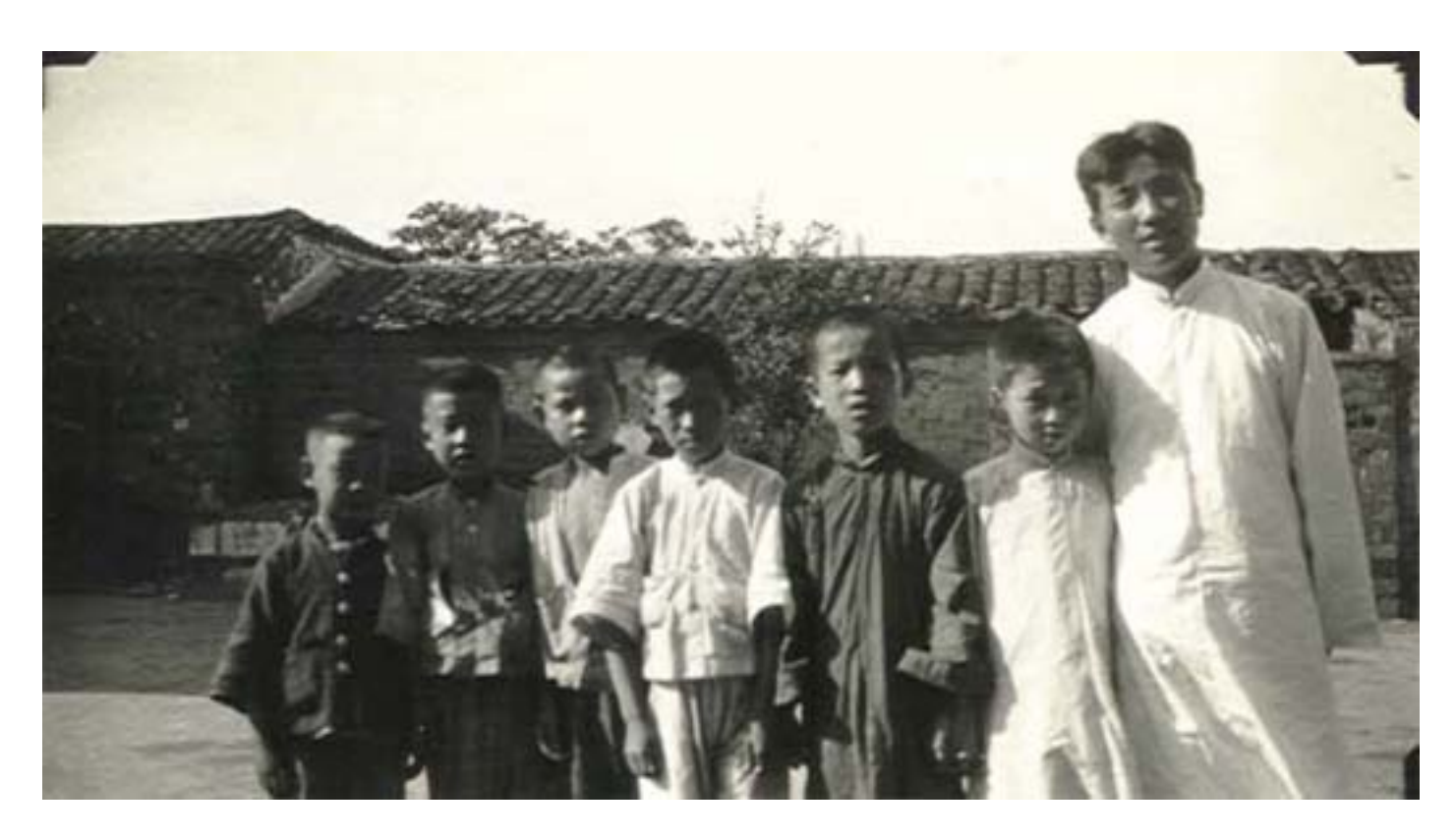
Teaching Sunday School